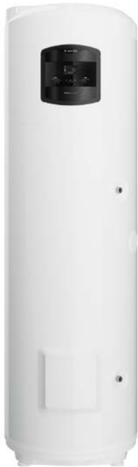
200L Direct/250L Indirect